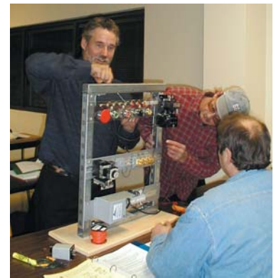
Participants wiring circuitry during lab exercise.

Sixteen participants from seven manufacturing and distribution companies participated in the Basic Electricity and Motor Controls course held at Dura-Bond Bearing Company in Carson City, Nevada last month. Dura-Bond was investigating options for training and was planning on sending three of their maintenance employees out of town for this condensed training. Instead, they contacted MAP to see if they could create and deliver this same offering locally. MAP worked in conjunction with Western Nevada Community College to provide this high quality, affordable, local training. Dura-Bond realized savings of approximately $5000 by not having to pay per diem and air fare, and also avoided additional time away from the plant for their maintenance crew.